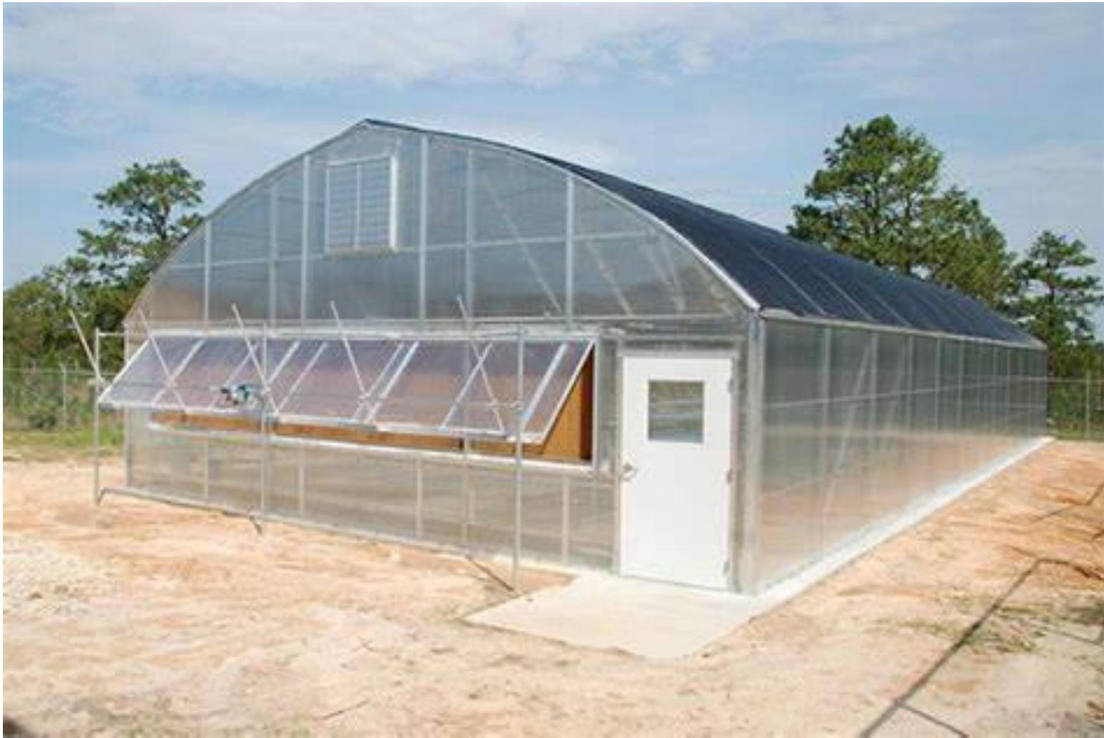
Illustration of Proposed Greenhouse